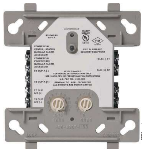
FMM-1(A) (Type H)

Use to monitor a zone of four-wire smoke detectors, manual fire alarm pull stations, waterflow devices, or other normally-