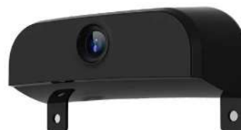
Thermal Sensor Module