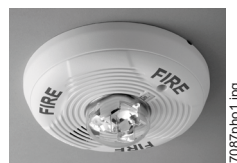
Indoor Ceiling Horn/Strobe