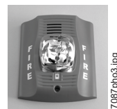
Indoor Wall Horn/Strobe