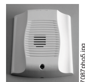
Indoor Wall Horn