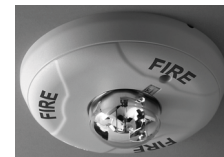
Indoor Ceiling Strobe