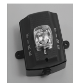
Outdoor Wall Strobe