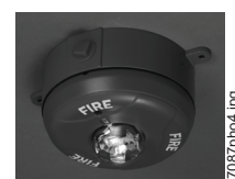
Outdoor Ceiling Strobe